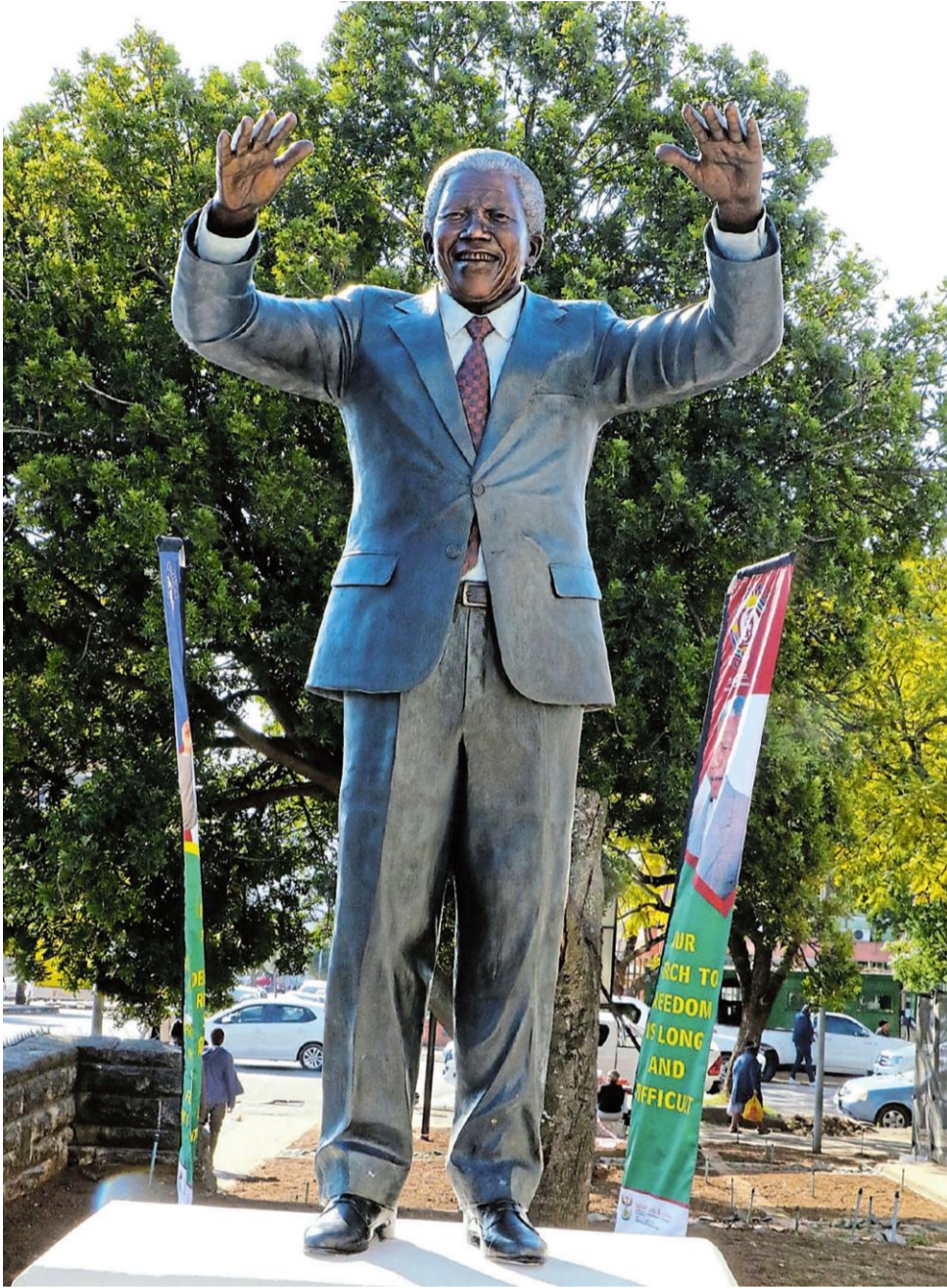
President Cyril Ramaphosa officially unveiled the Nelson Mandela statue in Mthatha on Mandela Day.

Mthatha: In the heartland of the Eastern Cape province lies the small town of Mthatha - home to the beautiful Nelson Mandela Museum.