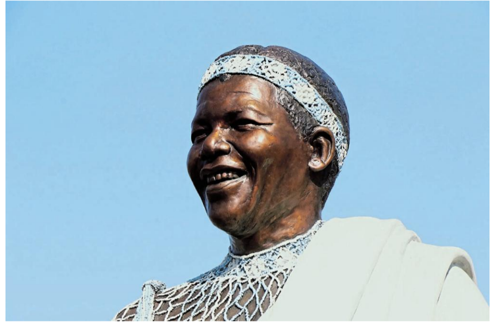
President Cyril Ramaphosa unveiled another Nelson Mandela statue in Qunu on Mandela Day.

This museum serves as a springboard and a channel for visitors to follow in the footsteps of Nelson Mandela, a global icon and champion for human rights. A man whose long walk to freedom began in the foothills that rise from the banks of the Mbashe River in Mvezo where his umbilical cord is buried, to the rolling hills of Qunu. Mandela's second home was in Qunu where his parents relocated to after his father, Chief Gandla, was deposed as legitimate