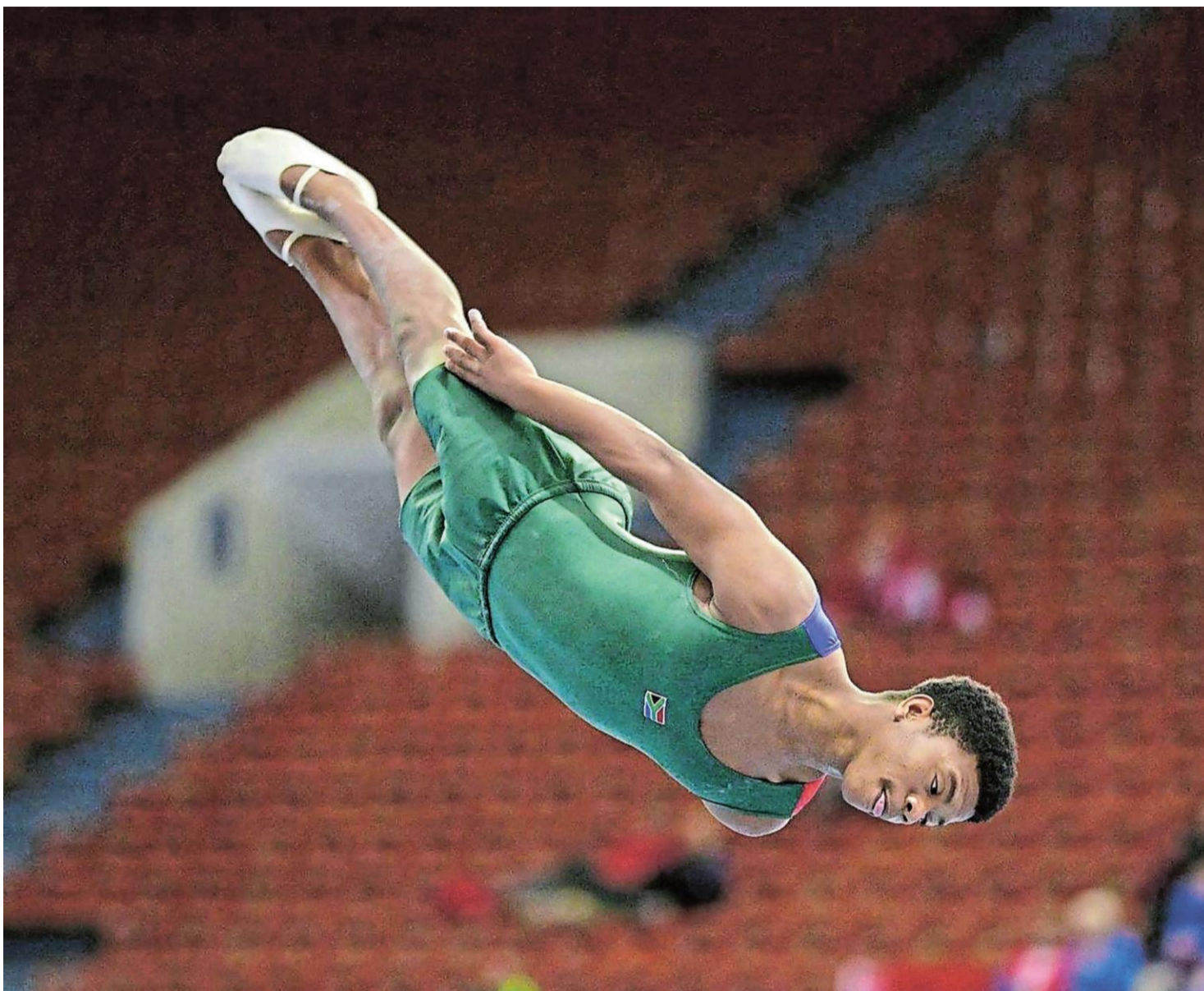
Royal St Andrews supports initiatives that empower communities through education, sports and more.

Families are offered relevant development opportunities making use of existing and tested programs. Collaboration with other