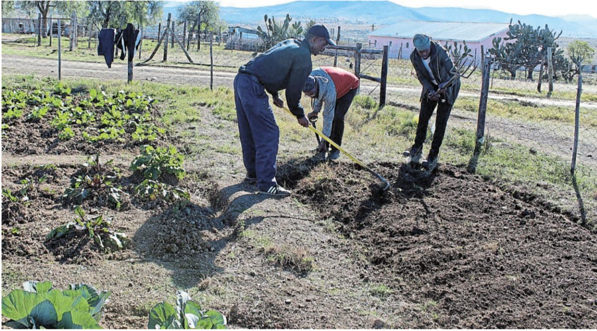
SPF has employed over 2,000 young people to assist in schools, health facilities and local CBOs while also being up-skilled to increase their employability

At 32,9% in the first quarter of 2023, South Africa's unemployment rate remains the highest in the world.